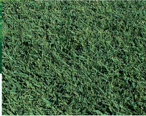
Temperature Tolerance Fahrenheit

Legendary golfer Greg Norman's signature hybrid bermudagrass, GN-1 is used primarily for athletic surfaces, parks and golf courses, and may also be suitable for a home lawn. With outstanding winter color and wear recovery, this dark green, medium textured hybrid bermudagrass is fast becoming the new standard for sports fields.